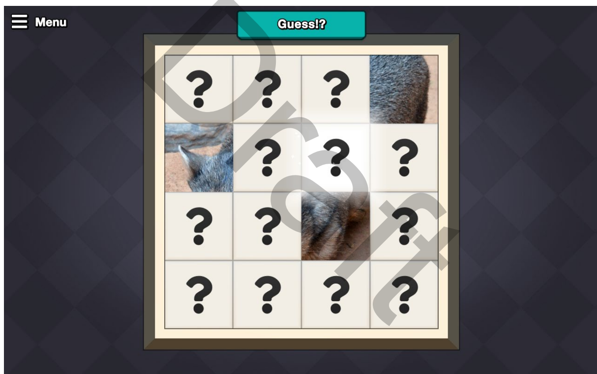
Figure 4 Reveal . Tiles that are turned successively to uncover pictures of popular motives.

Reveal (see figure 4) presented a grid of tiles which can be tapped to reveal part of an image. While the activity is similar to a jigsaw puzzle the pre-positioned tiles avoid the need to place pieces in a specific position, a task that can be next to impossible for some people with dementia. The tile-based interactions also lend themselves to turn taking while generating natural discussion between players as they tried to decipher who or what the image might be. We also presented a question or talking point alongside the title of the image when it was completed to encourage further discussion and mutual storytelling.