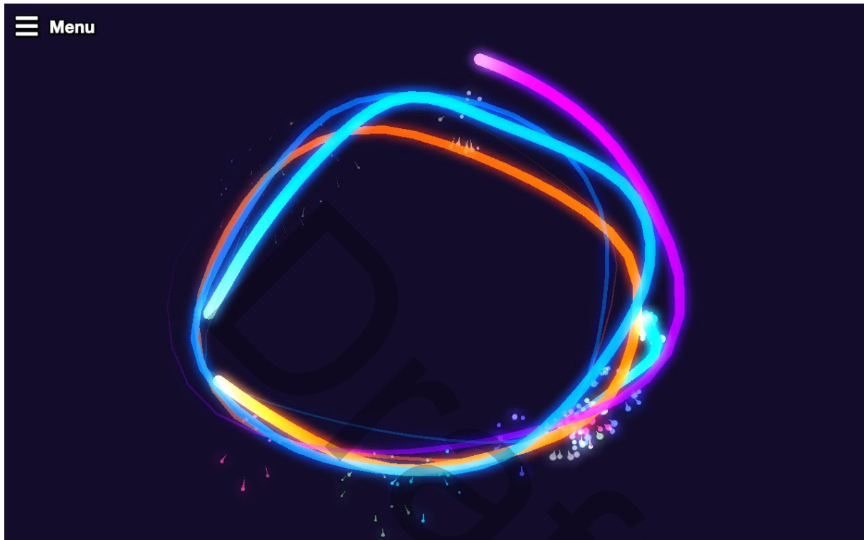
Figure 1 Traces . The application enables users to experience in free exploration how a touch screen works.

During co-design, we found lively music paired well with the activity influencing the participants' input and flow. Uplifting background music was produced based on user preferences and music memories encouraging engagement in the form of humming, nodding and finger-tapping. The interaction was successful at engaging people with advanced dementia, and in particular, participants with severe speech aphasia.