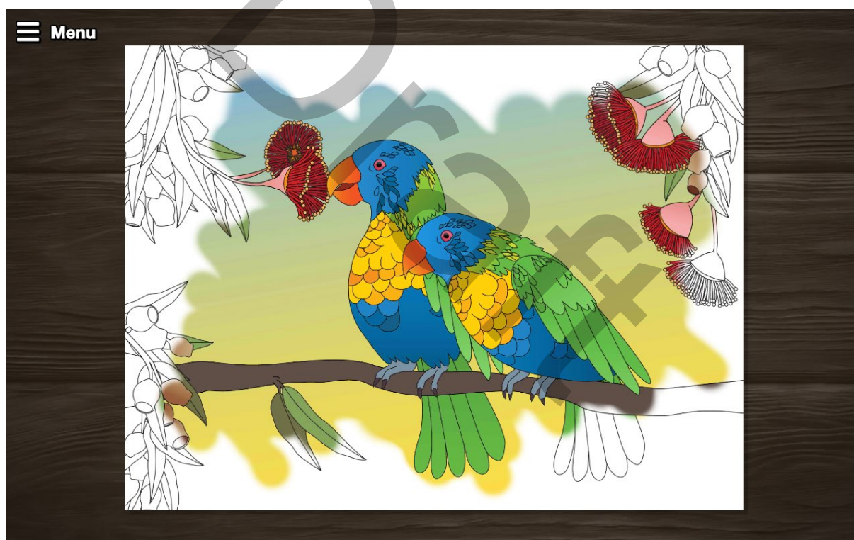
Figure 5 Co-Colouring is easy to use while providing a feeling of accomplishment through an animation element once the picture is filled in.

Instead of turning tiles to reveal an image, the colouring book inspired Co-Colouring (see figure 5). The activity used free form multi-touch swiping to magically colour-in a series of outlined artworks, which come to life with animation when completed (such as the parrot picking the seed pot). With multi-touch support, users were free to colour-in the images together as carefully or as carefree as they liked. The original artworks were based around familiar Australian themes (e.g. featuring native birds and backyard cricket), with the aim of presenting relatable and meaningful content that had the potential to encourage discussion and storytelling.